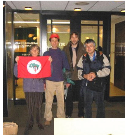
CBAN delegation at the Brazilian Consulate in Montreal (MST flag held up by Via Campesina member Union Paysanne). Nov 8 2007.

CBAN also has been able to act in solidarity with groups internationally. On November 8th CBAN coordinated actions with Members in three locations across Canada to denounce the killing of a Via Campesina organizer in Brazil by militia on Syngenta-owned land while protesting genetic engineering with 200 other farmers. The way in which CBAN Members quickly came together, in three different cities, to condemn the killing is just another example of why CBAN is so important.