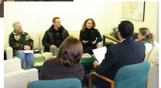
CBAN delegation in Ottawa speaks with staff at the Brazilian Embassy. Nov 8 2007.

Perhaps most heartening of all, are the innumerable actions that all our Member groups and active individuals take in their own communities: by writing letters to the editor in farm papers, by calling in to radio shows, and speaking out against the fraud that is genetic engineering. Together, CBAN and its Members are increasing public attention to agricultural issues and are encouraging greater solidarity and engagement between urban eaters and farmers, for food sovereignty and environmental justice.